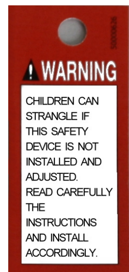
Orb Warning Label Only for stock blinds (Not made-to-measure)