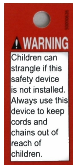
Tensioning Device Warning Label